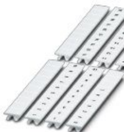
Zack marker strip, 10-section, horizontally labeled with the consecutive numbers: 91 ... 100, white, width: 8 mm

Please be informed that the data shown in this PDF Document is generated from our Online Catalog. Please find the complete data in the user's documentation. Our General Terms of Use for Downloads are valid ( http://phoenixcontact.com/download )