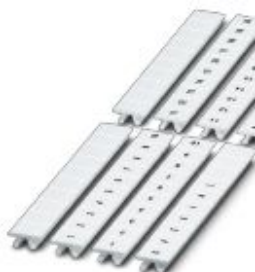
Zack marker strip, 10-section, horizontally labeled with the consecutive numbers: 81 ... 90, white, width: 8 mm

Please be informed that the data shown in this PDF Document is generated from our Online Catalog. Please find the complete data in the user's documentation. Our General Terms of Use for Downloads are valid ( http://phoenixcontact.com/download )