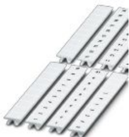
Zack marker strip, 10-section, horizontally labeled with the consecutive numbers: 11 ... 20, white, width: 8 mm

Please be informed that the data shown in this PDF Document is generated from our Online Catalog. Please find the complete data in the user's documentation. Our General Terms of Use for Downloads are valid ( http://phoenixcontact.com/download )