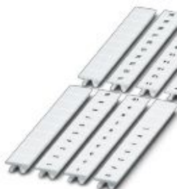
Zack marker strip, 10-section, horizontally labeled with the consecutive numbers: 1 ... 10, white, width: 8 mm

Please be informed that the data shown in this PDF Document is generated from our Online Catalog. Please find the complete data in the user's documentation. Our General Terms of Use for Downloads are valid ( http://phoenixcontact.com/download )