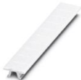
Zack marker strip, 10-section, horizontally labeled with the consecutive numbers: 91 ... 100, white, width: 6 mm

Please be informed that the data shown in this PDF Document is generated from our Online Catalog. Please find the complete data in the user's documentation. Our General Terms of Use for Downloads are valid ( http://phoenixcontact.com/download )