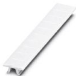
Zack marker strip, 10-section, horizontally labeled with the consecutive numbers: 31 ... 40, white, width: 6 mm

Please be informed that the data shown in this PDF Document is generated from our Online Catalog. Please find the complete data in the user's documentation. Our General Terms of Use for Downloads are valid ( http://phoenixcontact.com/download )