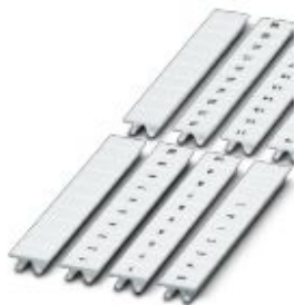
Zack marker strip, 10-section, horizontally labeled with the consecutive numbers: 81 ... 90, white, width: 5 mm

Please be informed that the data shown in this PDF Document is generated from our Online Catalog. Please find the complete data in the user's documentation. Our General Terms of Use for Downloads are valid ( http://phoenixcontact.com/download )