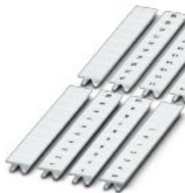
Zack marker strip, 10-section, horizontally labeled with the consecutive numbers: 61 ... 70, white, width: 5 mm

Please be informed that the data shown in this PDF Document is generated from our Online Catalog. Please find the complete data in the user's documentation. Our General Terms of Use for Downloads are valid ( http://phoenixcontact.com/download )