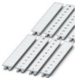
Zack marker strip, 10-section, horizontally labeled with the consecutive numbers: 21 ... 30, white, width: 5 mm

Please be informed that the data shown in this PDF Document is generated from our Online Catalog. Please find the complete data in the user's documentation. Our General Terms of Use for Downloads are valid ( http://phoenixcontact.com/download )