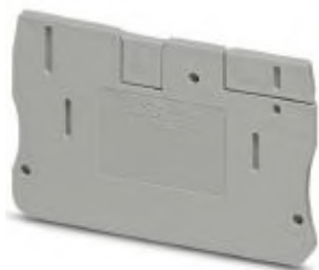
End cover, length: 57.7 mm, width: 2.2 mm, height: 36 mm, color: gray

Please be informed that the data shown in this PDF Document is generated from our Online Catalog. Please find the complete data in the user's documentation. Our General Terms of Use for Downloads are valid ( http://phoenixcontact.com/download )