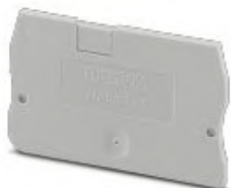
End cover, length: 48.6 mm, width: 2.2 mm, height: 29.1 mm, color: gray

Please be informed that the data shown in this PDF Document is generated from our Online Catalog. Please find the complete data in the user's documentation. Our General Terms of Use for Downloads are valid ( http://phoenixcontact.com/download )