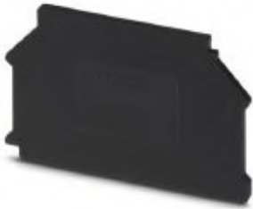
End cover, length: 58 mm, width: 2.2 mm, height: 35.05 mm, color: black

Please be informed that the data shown in this PDF Document is generated from our Online Catalog. Please find the complete data in the user's documentation. Our General Terms of Use for Downloads are valid ( http://phoenixcontact.com/download )