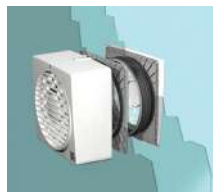
KIT VV 150/6" (DOPPI VETRI)