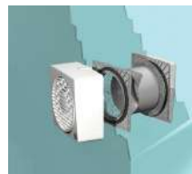
KIT FF 150/6" (DOPPIA FINESTRA)