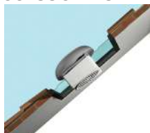
KIT TE 150/6" (TORRETTA)