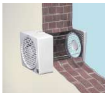
KIT MU (MURO)