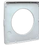
S 100/4 Code 22154