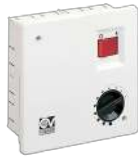
SCNRB SCAT.COM.NON REV.INCASSO Code 12971