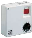
C 1.5 (COMANDO EL. 1.5 A) Code 12966