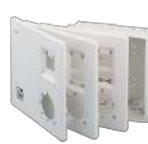
KIT SCB (TRASF.E.C.) Code 22481