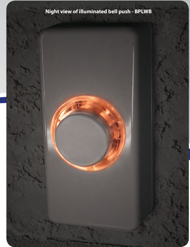
Night view of illuminated bell push - BPLWB