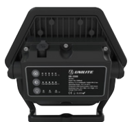
REAR CONTROL PANEL