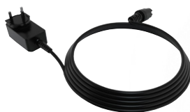
5M POWER/CHARGE CABLE